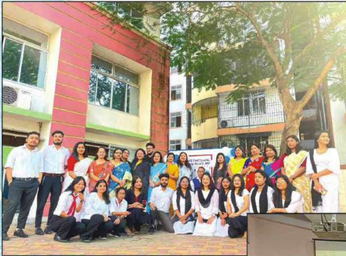
International Human Rights Day 10th December 2022