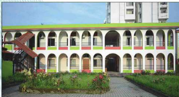
NERIM Commerce College Building