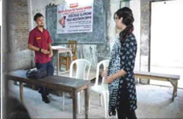
10th September: World Suicide Prevention Day