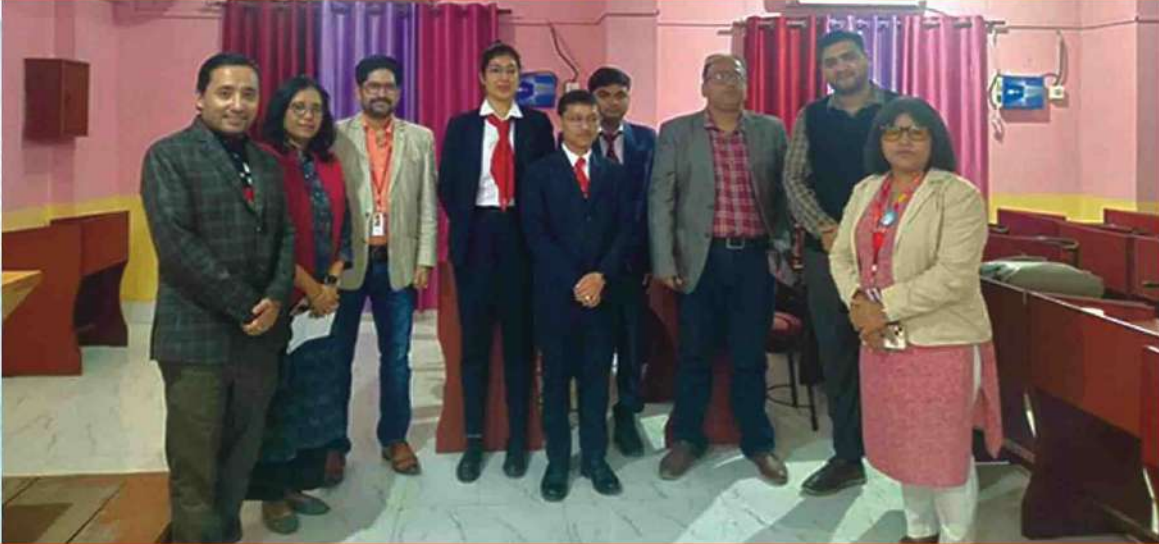
The Training and Placement Department in collaboration with Dept of Business Administration conducted pool campus drive for Aditya Birla Group-Pantaloons on 19th December 2022