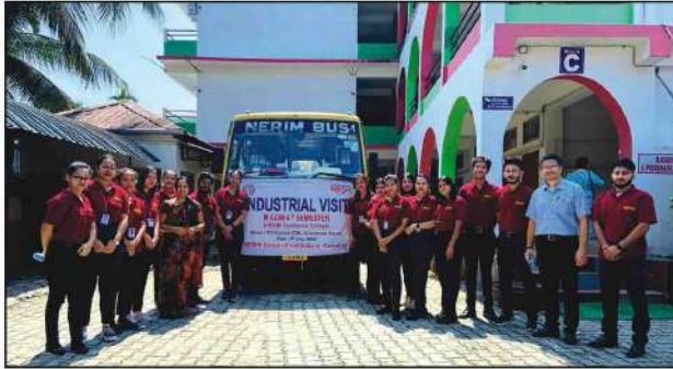
Commerce Industrial Visit-I