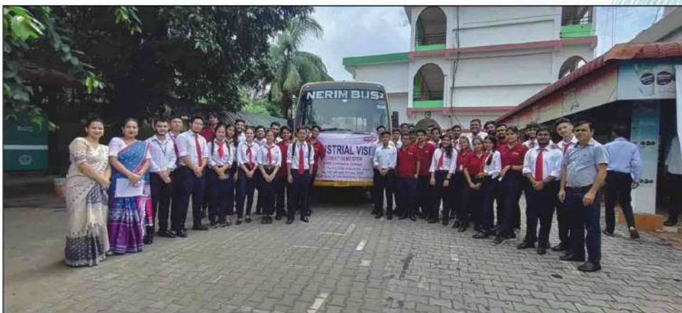
Industrial visit by Students of NERIM Commerce College