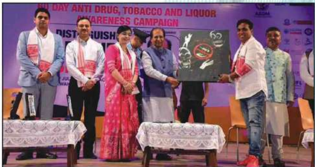
Interactive session with the Governor of Assam, Prof. Jagdish Mukul