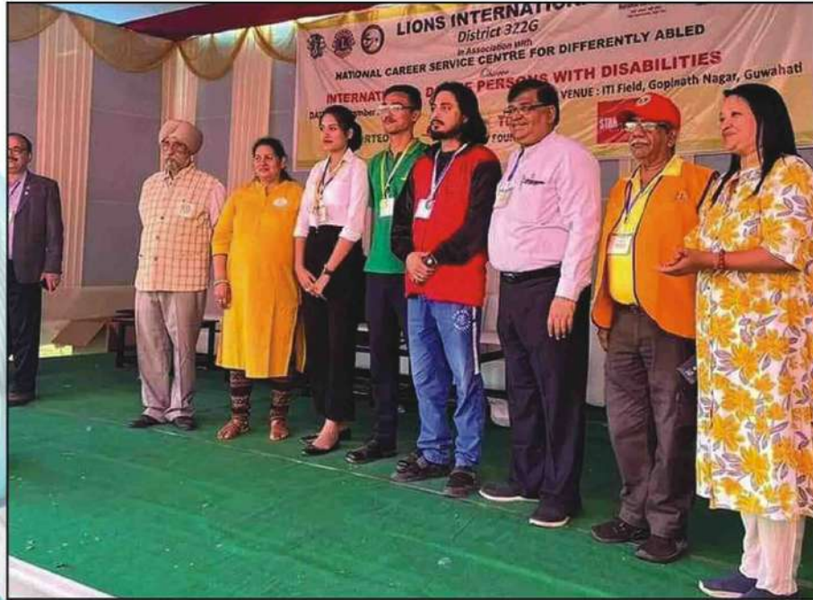
Observing international day of disabled persons