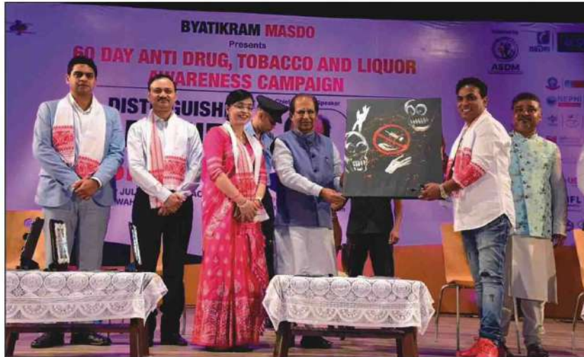
An interactive session with His Excellency, the Governor of Assam, Prof. Jagdish Mukhi, organised by Byatikram MASDO on 26th July'22.