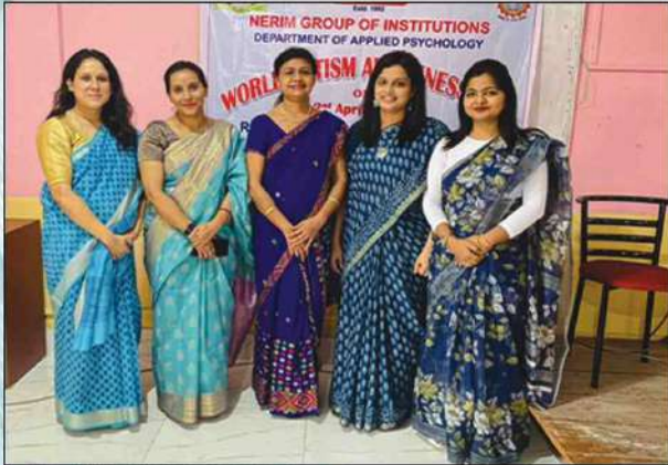
2nd April: World Autism Awareness Day