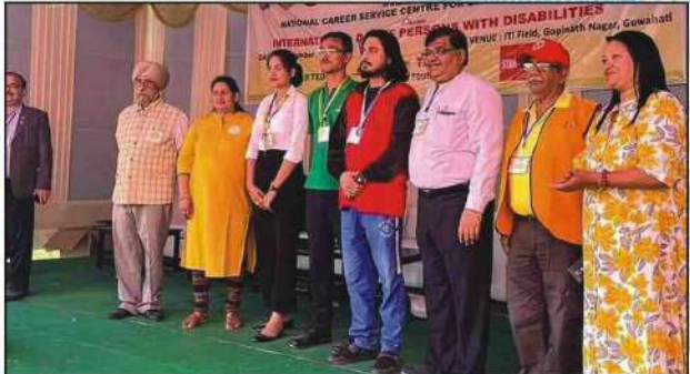
International Day of Disabled Person