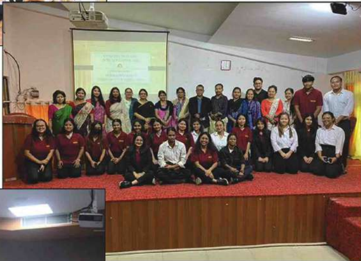
Constitution Day 26th November 2022