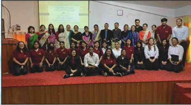
Constitution Day 26 Nov 22