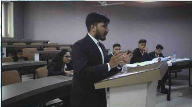
Moot Court Competition June 22