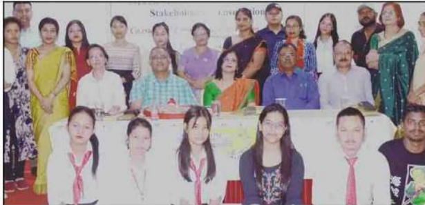
Green Action Week