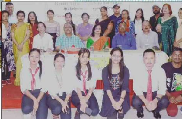
Green Action Week, organised by Consumer Legal Protection Forum.