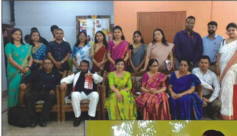
Faculty Members of Dr. ABS College of Education