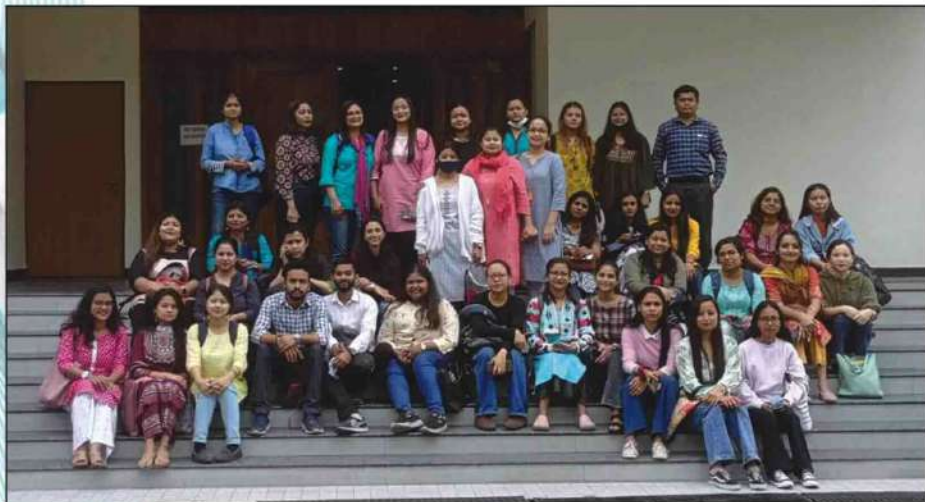
Educational Trip in Dr. Anita Baruah Sarmah College of Education