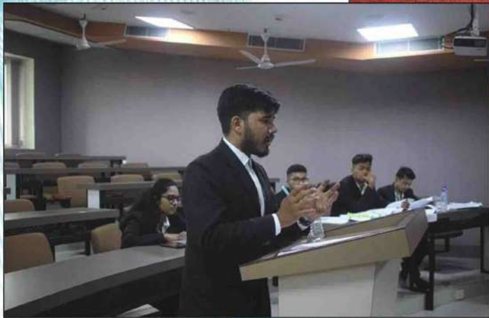
Moot Court Competition June22