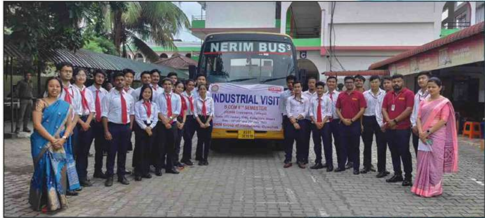
Industrial visit by Students of NERIM Commerce College