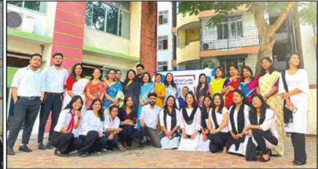
International Human Rights Day 10 Dec 22