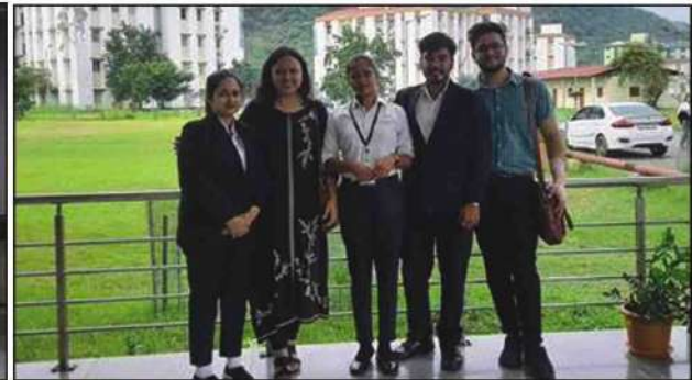
Moot Court June 22