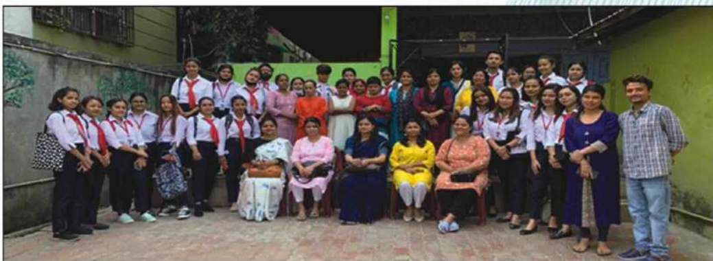
21st March, 2022: World Down Syndrome Awareness Day