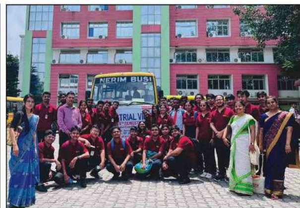
Industrial visit to Amtron in 2022 (Faculty and Students)