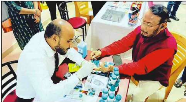
Har Din Har Ghar AYURVEDA on 15th November, 2022