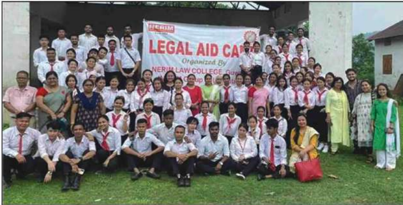
Legal Aid Camp 29 May 2022