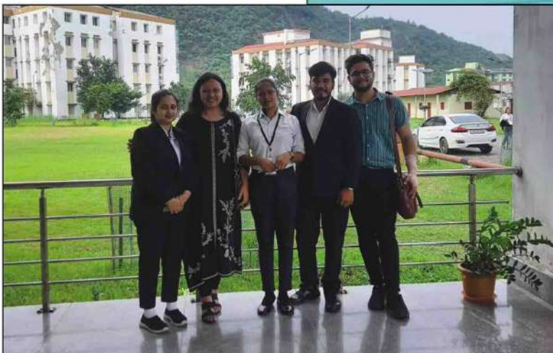
3rd Vox Anatolis National moot court competition organized by National Law University and Judicial Academy Assam, 3rd June to 5th June, 2022