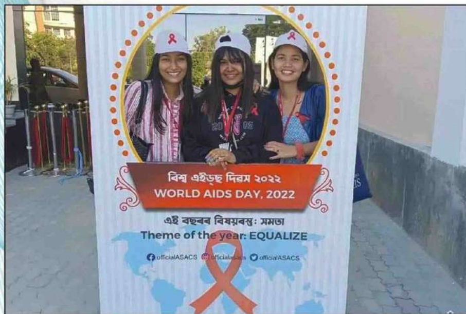
Observing World AIDS Day on 1st December,2022