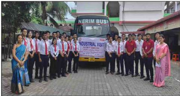
Commerce Industrial Visit-III