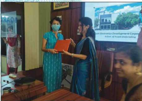
Industrial visit to Amtron in 2022