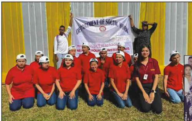
Students at Ashadeep Day care & Rehabilitation centre for mentally challenged