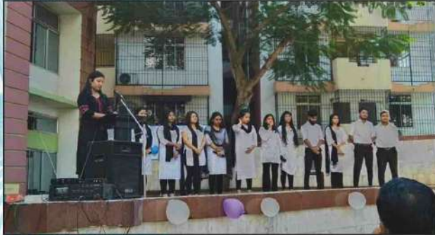
Human Rights Day