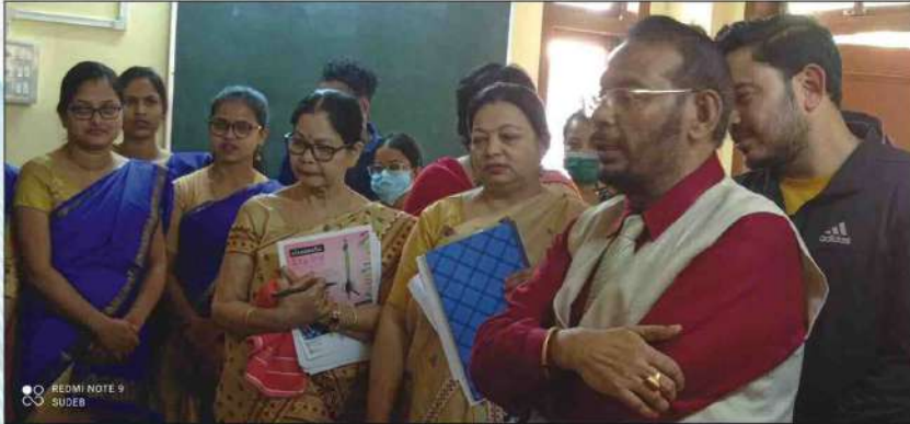
Cooking Competition in Dr. Anita Baruah Sarmah College of Education