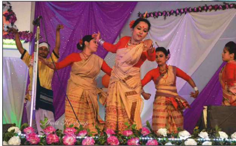
Bihu Dance in College