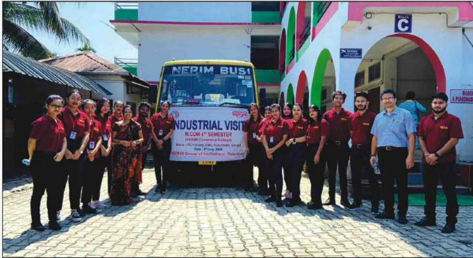
Industrial visit by Students of NERIM Commerce College