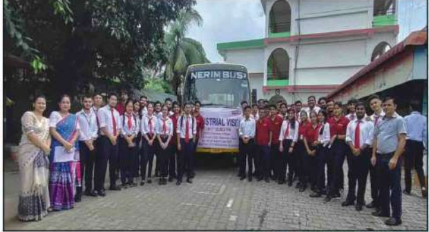
Commerce Industrial Visit-II