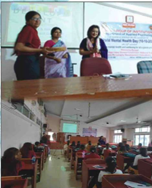
10th October: World Mental Health Day