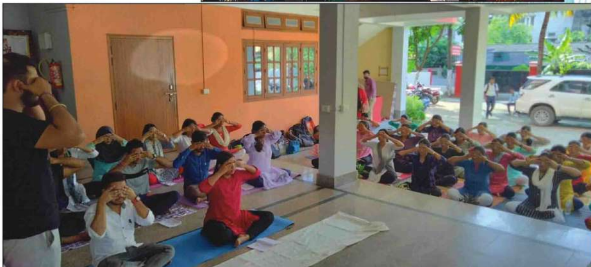
Yoga Session during the Induction Programme 2022