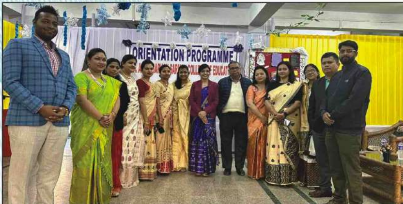
Faculty Members, Dr. ABS College of Education with the Director, NERIM Group of Institutions